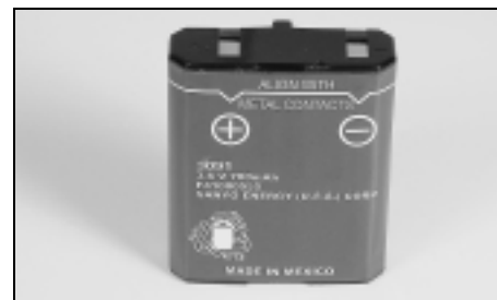
PART NO.: BATT-9150 3.6V 700MAH NI-CAD AT&T 3091