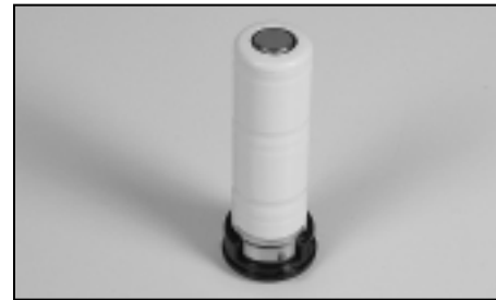
PART NO.: BATT-4000 3.6V 110MAH NI-CAD PANASONIC KX-A38