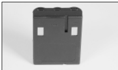
PART NO.: BATT-9111 3.6V 300MAH NI-CAD VTECH VT9111