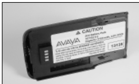
PART NO.: BATT-9030EXT 4.8V 2150MAH NI-MH AT&T TRANSTALK 9031