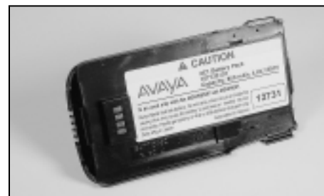
PART NO.: BATT-9030 4.8V 800MAH NI-MH AT&T TRANSTALK 9030