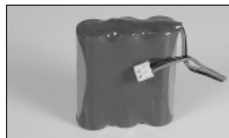
PART NO.: BATT-2414 3.6V 1500MAH NI-MH AT&T 2414