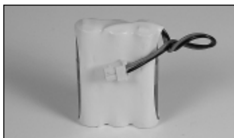
PART NO.: BATT-2400 3.6V 600MAH NI-MH S.W. BELL GH2400