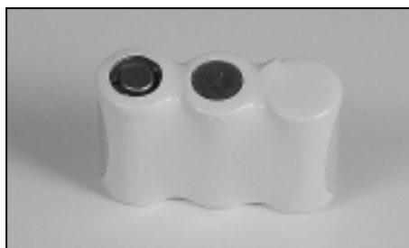
PART NO.: BATT-3430 3.6V 600MAH NI-MH AT&T 3430