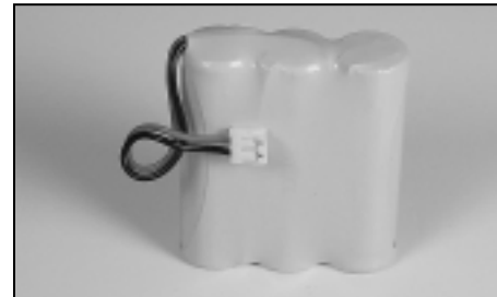
PART NO.: BATT-3300 3.6V 600MAH NI-CAD AT&T 3300/3301