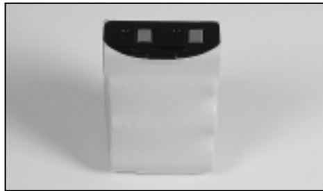
PART NO.: BATT-3500 3.6V 500MAH NI-CAD AT&T 3500