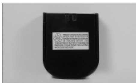
PART NO.: BATT-1980 4.8V 600MAH NI-CAD VTECH VT1980