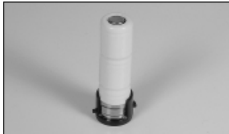
PART NO.: BATT-3000 3.6V 110MAH NI-CAD PANASONIC KX-A37