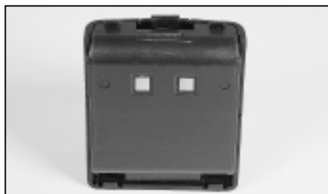
PART NO.: BATT-9000 4.8V 600MAH NI-CAD PANASONIC KX-A39