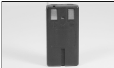
PART NO.: BATT-2431 2.4V 1500MAH NI-MH VTECH, AT&T AND OTHERS