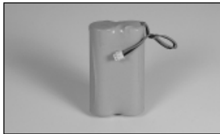
PART NO.: BATT-509 2.4V 1500MAH NI-MH PANASONIC HHR-P509