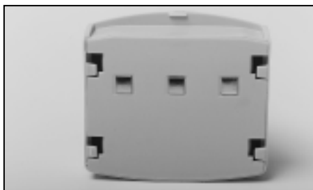
PART NO.: BATT-1916 3.6V 600MAH NI-CAD RADIO SHACK