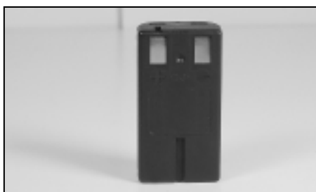
PART NO.: BATT-1000N 2.4V 1500MAH NI-MH PANASONIC KX-TG1000N