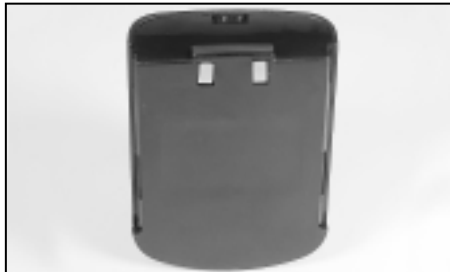
PART NO.: BATT-902 6V 700MAH NI-CAD VTECH 900/950NDL